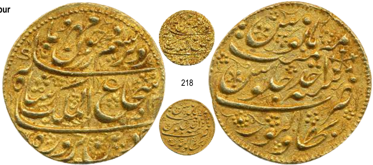
218 Durrani, Shah Shuja al Mulk , 2nd region, Gold Mohur, 11.09g, Bahawalpur Mint, AH 12(18)/ RY Ahad (KM# 255). Full dotted circle, complete mint name on bottom of reverse. Extremely fine, rare.