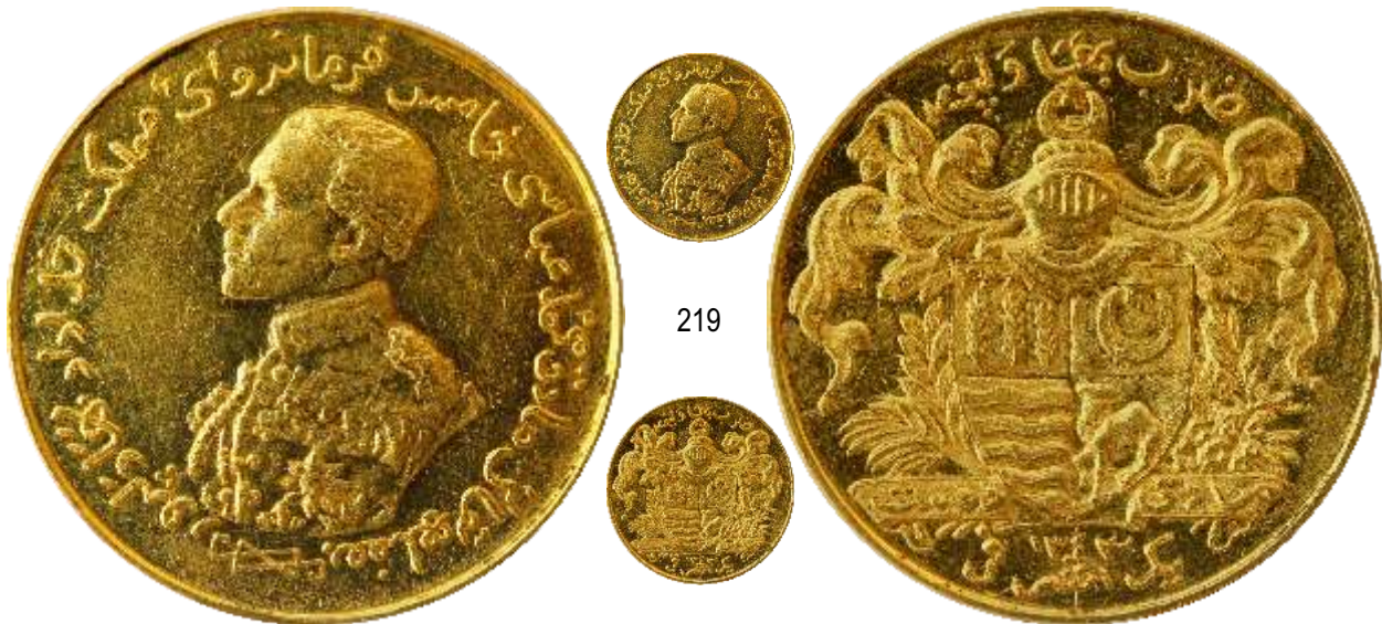
219 Sadiq Muhammad Khan V , Gold Nazrana Ashrafi, 7.51g, Bahawalpur Mint, Obv: Portrait of Nawab Sadiq Muhammad Khan in Military uniform facing left, Persian legend " ba-Fazlah taalab Sadiq Mohammed Abbasi Khamis Farman Rawai mamlakat khudadat Bahawalpur ", Rev: Ornate helmeted arms, Persian legend, ' Zarb Bahawalpur ' at top and ' Yek Ashrafi ' at bottom with Date (KM# X#M11). Very rare.