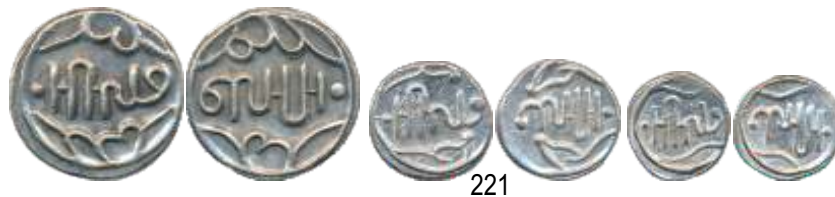
221 Lakshman Singh , Silver (3), Rupee, 1/2 Rupee & 1/4 Rupee, 8.04g, 4.04g, 2.02g, "Samsatraba" type (KM# 16, 22 & 21). Very fine+, rare. 3 coins.