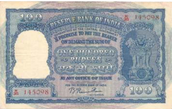
442 Rupees 100, 3rd issue, Type 7.3, Signed B Rama Rau, Prefix A30, Bombay circle (Jhun# 7.3.1). Folded, usual pin holes & thread holes, water dirt on both sides, discoloured, good. Sold ₹ ..... Estimate: ₹ 500-700