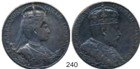
240 Edward VII, Coronation Silver, 12.58g, 9 August 1902, Obv: Bust of the Emperor Edward VII to right, Rev: Bust of Queen Alexandra to right. Very fine+.

Realised ` ..... Estimate: ` 3,000-4,000