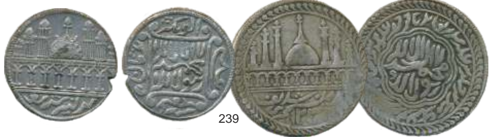
239 Islamic Token (2), Obv: Holy Masjid, Rev: Kalima. Very fine. 2 Tokens.

Realised ` ..... Estimate: ` 1,500-2,000