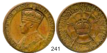
241 Edward VIII, Bronze, 11.72g, "Coronation of Edward VIII", Obv: Crowned and draped bust of Edward VIII left, Rev: Crown on crossed sceptres on a Tudor Rose. Very fine+.

Realised ` ..... Estimate: ` 3,000-4,000