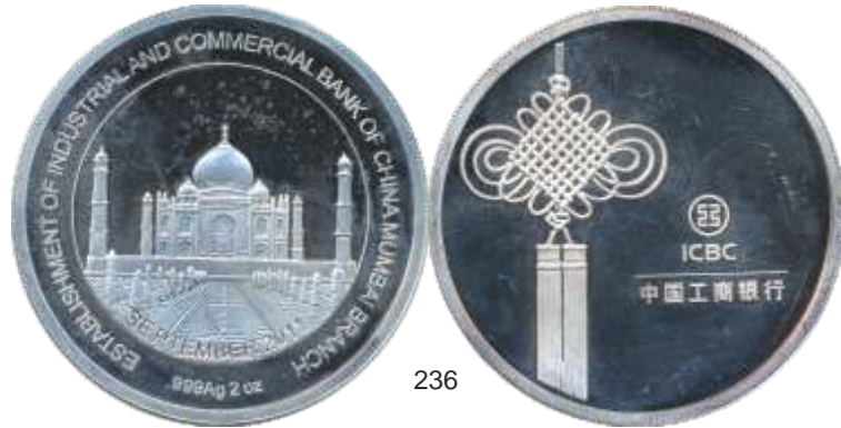
236 Taj Mahal, Silver Token, 2 Oz, 62.30g, Commemorating Establishment of Industrial and Commercial Bank of China, Mumbai Branch, September 2011, Obv: Full view of Taj Mahal within circle, legend around, Rev: Logo of Bank. Uncirculated.

Realised ` ..... Estimate: ` 3,000-4,000