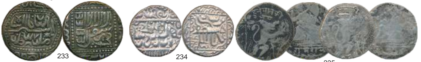
233 Imitating of Silver Rupee of Sher Shah Suri, 12.69g. Extremely fine.

Realised ` ..... Estimate: ` 1,200-1,500