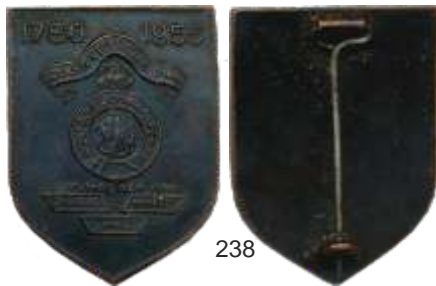
238 Army Badge, Copper, Madras Sappers and Miners 1780 to 1955. Very fine.

Realised ` ..... Estimate: ` 1,200-1,500