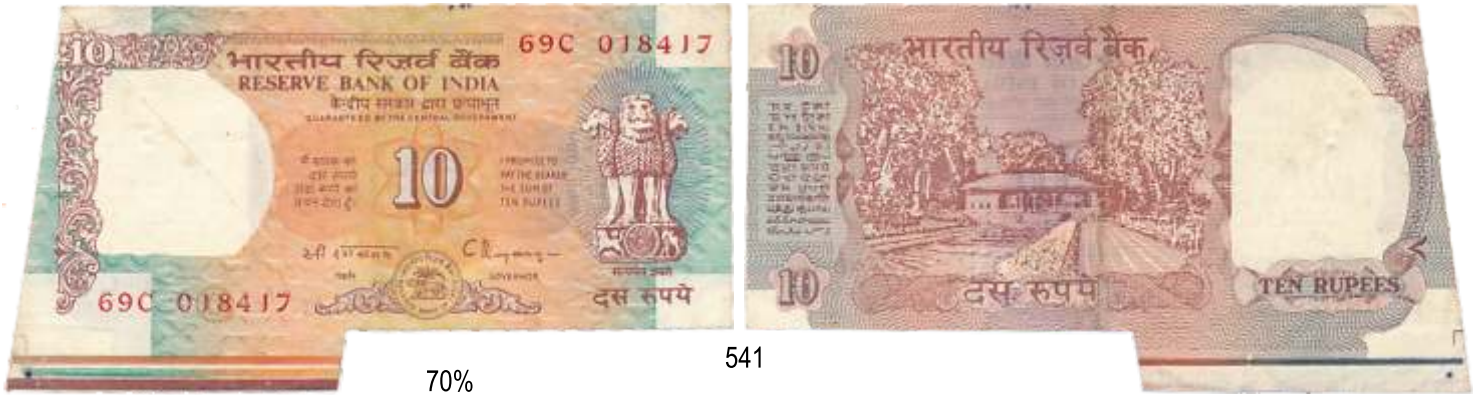
541 Rupees 10, Error, Signed C Rangarajan, Prefix 69C. Extremely fine.